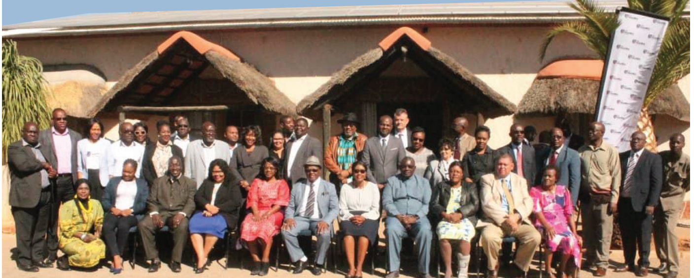
Prime Minister Dr. Saara Kuugongelwa-Amadhila (3rd from right) and the host MICT Minister; Hon. Stanley Simataa (2nd from right) posing for a group picture with participants at the Nationhood and National Pride Strategic Plan Consultative Workshop on 27 August 2019.

Prime Minister Dr. Saara Kuugongelwa-Amadhila says Namibia's diverse cultures and traditions should not be a source of division but a pillar of strength as the country marches towards Vision 2030.