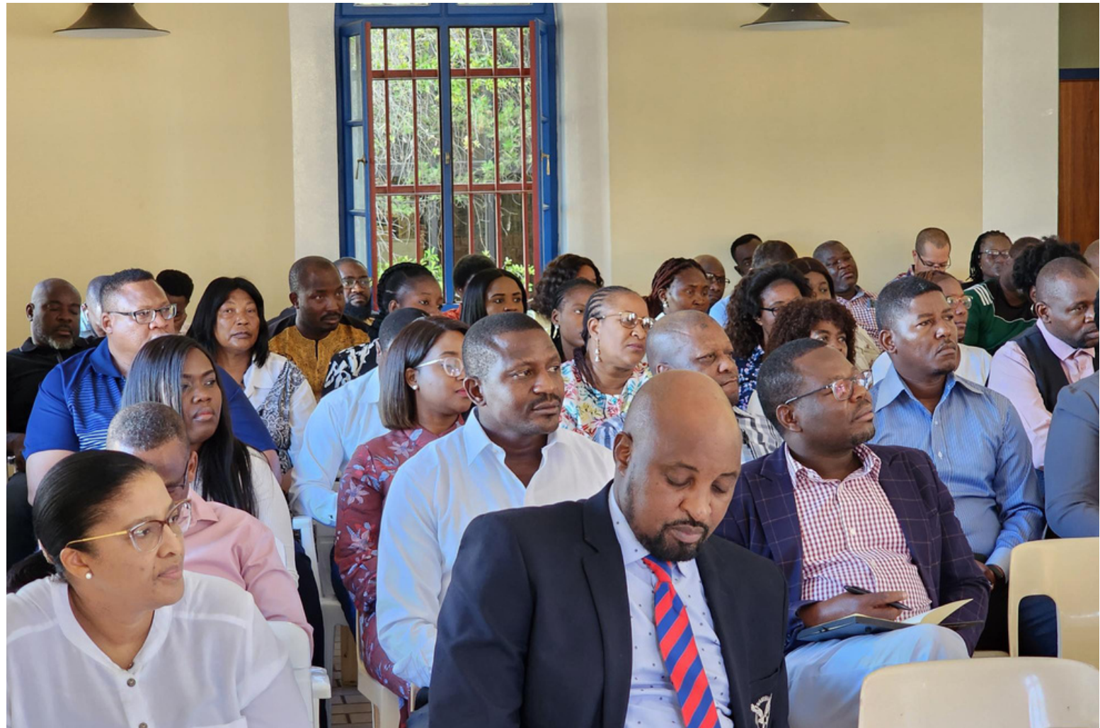
Staff members in the Ministry of Sport, Youth and National Service, Namibia Sports Commission, National Youth Council and National Youth Service

“Our young people are hopeful. Let’s strive to excel in all areas of our mandate and try to work in harmony.”