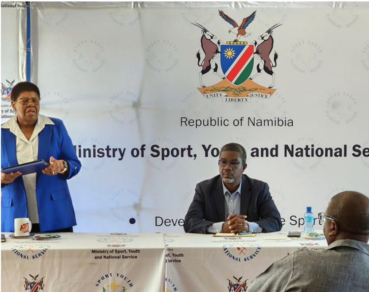
Hon. Agnes Tjongarero, Minister of Sport, Youth and National Service with Mr Mbumba Haitengela, Executive Director

She further instructed management to finalize outstanding matters such as the drafting of the new sports act, completion of the Eenhana sports complex, the commencement of the construction of the Nkurenkuru Multi-Purpose Youth Centre and sports complex, completion of the Berg Aukas electrification project, development of the sport as well as the youth development indexes, the resumption of the Namibia Youth Credit Scheme, the implementation of the one hundred and twenty-one (121) Rural Youth Enterprises, as well as the renovation and upgrading of the Independence Stadium, amongst others.