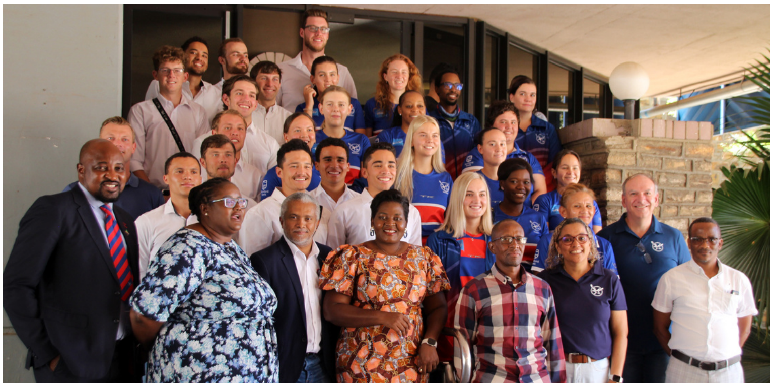
Hon. Emma Kantemaa - Gaomas, Deputy Minister of Sport, Youth and National Service with Women and Men Hockey Teams and senior officials in the Ministry and Namibia Sports Commission

The Deputy Minister of Sport, Youth and National Service, Honourable Emma Kantema - Gaomas, officially send off the National Men, and Women Senior Indoor Hockey Teams, set to participate in the upcoming 2023 Hockey World Cup, which will be hosted in Pretoria, South Africa, from 5 - 12 February 2023.