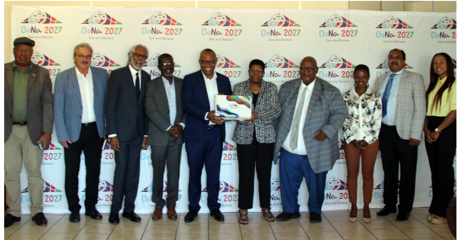
Hon. Agnes Tjongarero, Minister of Sport, Youth and National Service with officials from Ruben Reddy Architects, FIFA/NFA Normalisation Committee, Ministry of Sport, Youth and National Service and BONA Committee

On 29 March 2023, the Ruben Reddy Architects presented the Facilities Audit Report to Hon. Agnes Tjongarero, Minister of Sport, Youth and National Service.