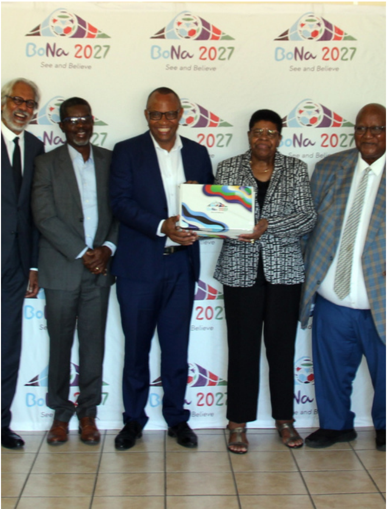
Hon. Agnes Tjongarero, Minister of Sport, Youth and National Service with officials from Ruben Reddy Architects, FIFA/NFA Normalisation Committee, Ministry of Sport, Youth and National Service and BONA Committee

Once Honourable Tjongarero presents the report to His Excellency Hage G. Geingob, President of the Republic of Namibia and Commander in Chief, the content of the report will be shared with the Namibian nation.