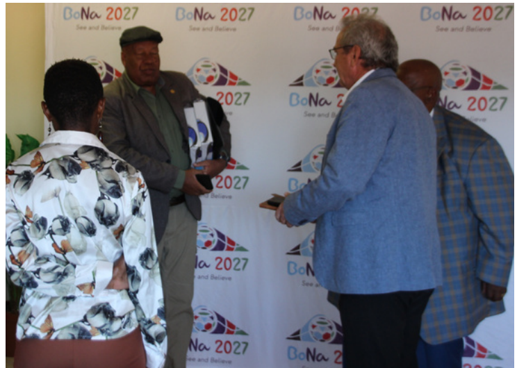
Officials from FIFA/NFA Normalisation Committee and BONA Committee