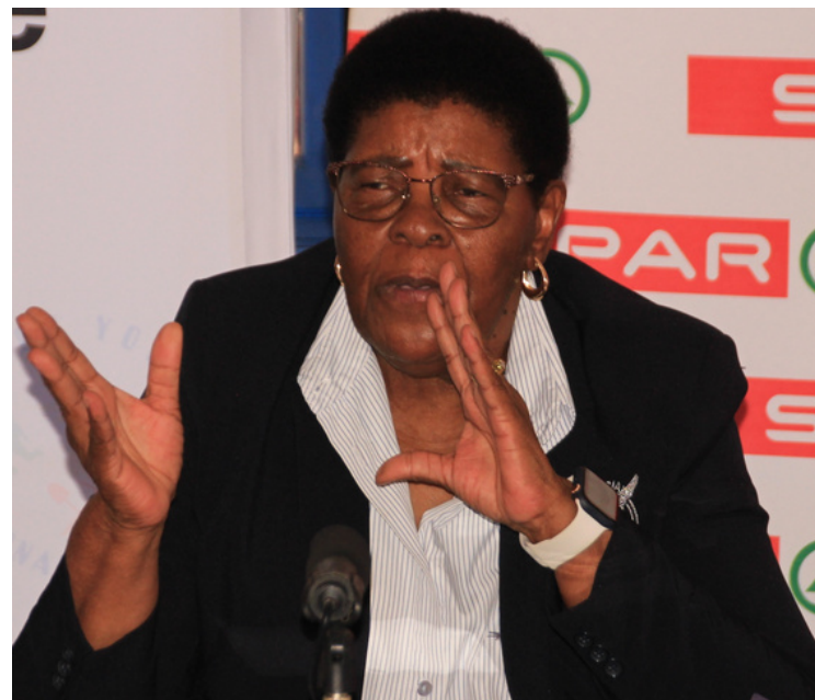
Hon. Agnes Tjongarero Minister of Sport, Youth and National Service

Some Spar stores will concurrently host a similar race for people outside the Windhoek area.