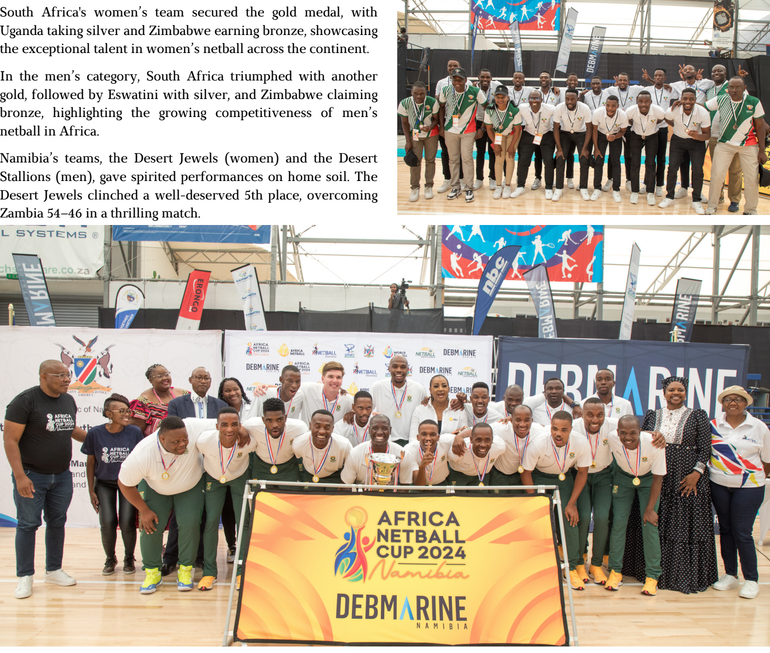
The official newsletter of the Ministry of Sport, Youth and National Service

The women's competition comprised of eight teams from Eswatini, Kenya, Lesotho, Malawi, South Africa, Uganda, Zambia, and Zimbabwe. In the men's competition, the team comprised from Eswatini, Kenya, Lesotho, South Africa, Zambia, and Zimbabwe.