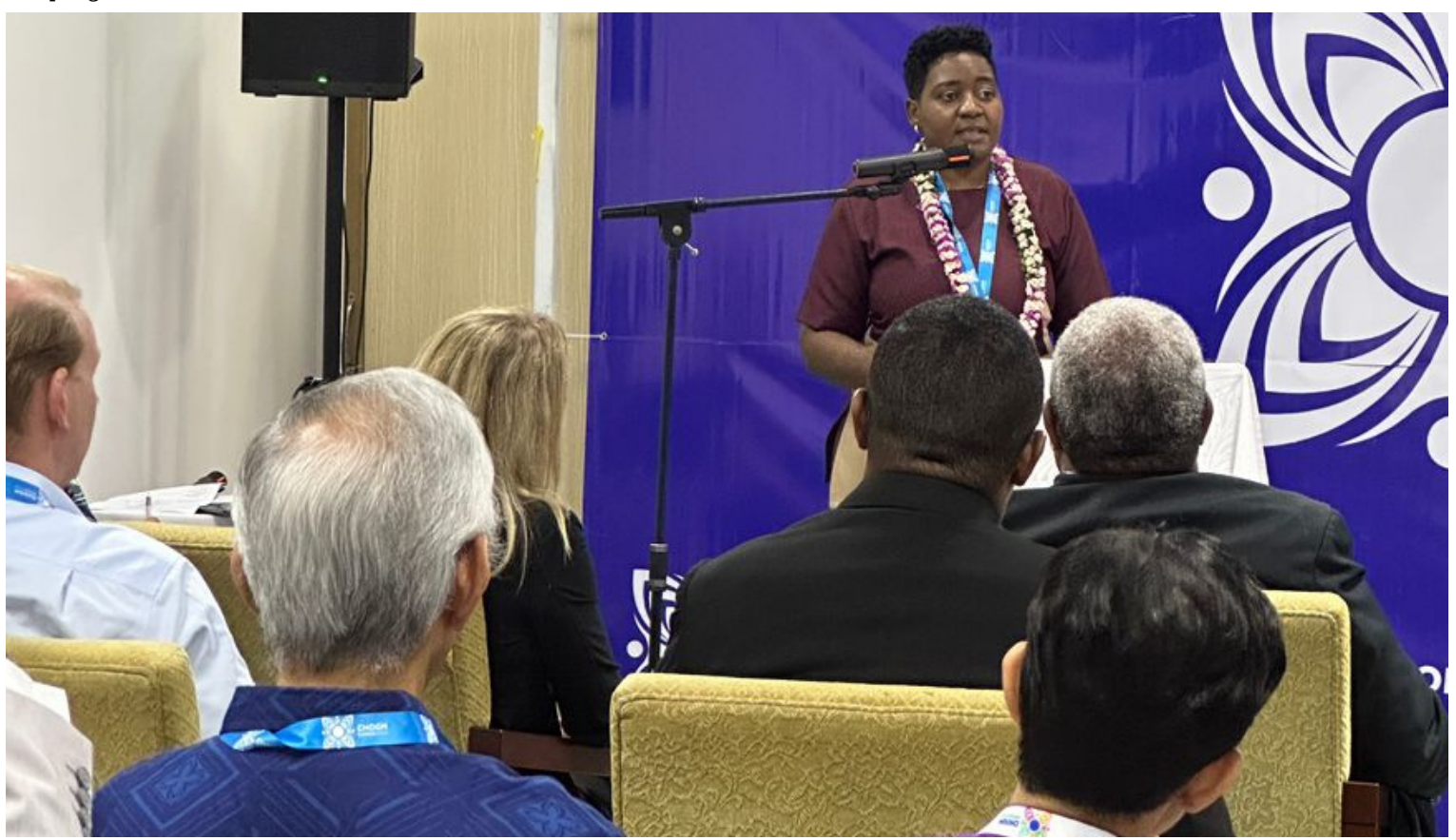
The official newsletter of the Ministry of Sport, Youth and National Service

Namibia's participation in the event highlighted its dedication to positioning youth at the forefront of the Fourth Industrial Revolution, paving the way for a more innovative and inclusive future.