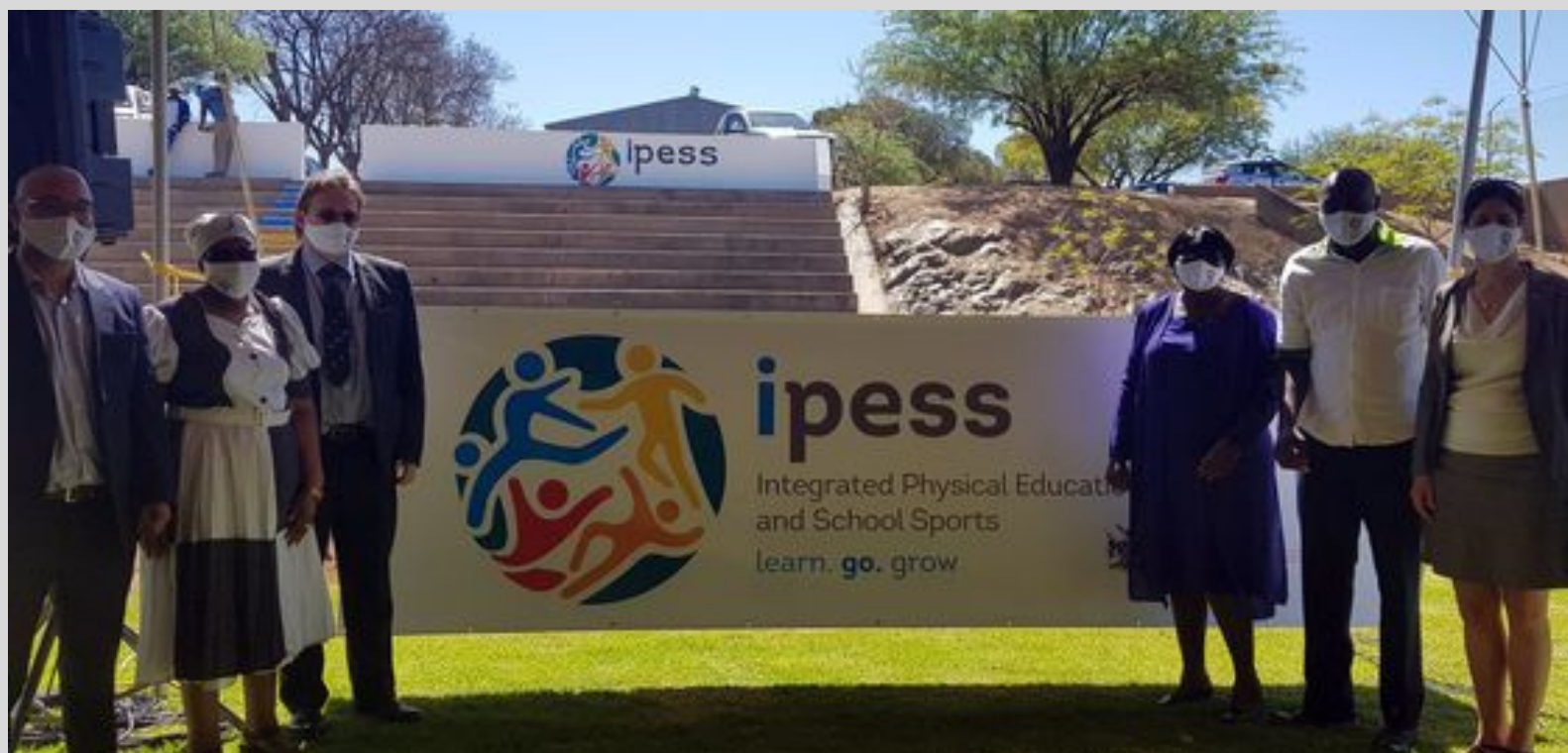
Official launch of the Integrated Physical Education and School Sport (IPESS) Advocacy Campaign

In line with the Ministry's mandate of sport development, the Ministry of Sport, Youth and National Service signed a Terms of Reference agreement with the Ministry of Education, Arts and Culture, to ensure improved implementation of the integrated physical education and school sport advocacy campaign.