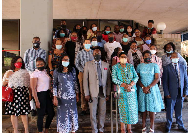
Directorate of General Services staff members