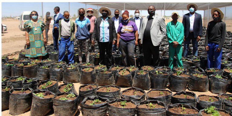
Hon. Agnes Tjongarero with the Hardap Horticulture Beneficiaries

“The objective of this self-employment project, particularly horticulture that we are launching today is to increase the skills, productivity and income potential of today and tomorrow’s out of school youth in peri – urban and rural areas, by testing cost effective and scalable market-based solutions to strengthen micro-entrepreneurship opportunities and to build the institutional infrastructure for future interventions in this area”, said Hon. Tjongarero.