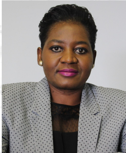
Hon. Emma Kantema-Gaomas Deputy Minister