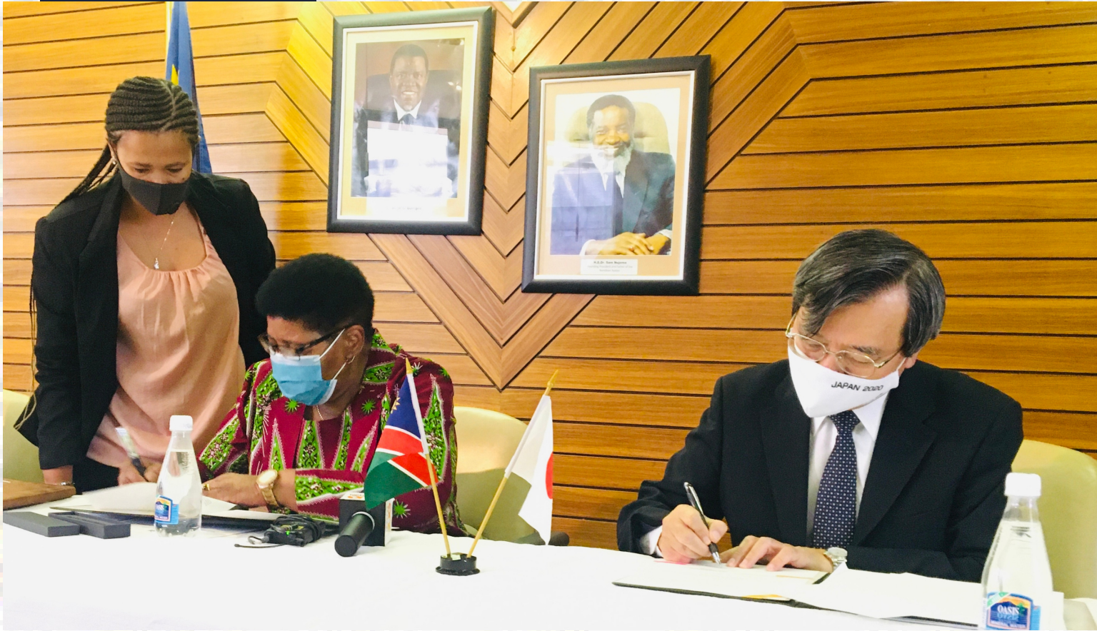
Hon. Agnes Tjongarero, Minister of Sport, Youth and National Service with His Excellency Hideaki Harada, Ambassador of Japan to Namibia

On Wednesday, 28 October 2020, a Memorandum of Cooperation (MOC) in the field of Sports was officially signed between the Government of the Republic of Namibia and the Government of Japan, by Hon. Agnes Tjongarero, Minister of Sport, Youth and National Service and His Excellency Hideaki Harada, Ambassador of Japan to Namibia.