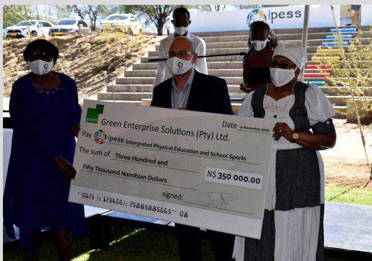
Sponsorship towards IPESS by Green Enterprise Solutions Pty Ltd

Green Enterprise Solutions Pty Ltd, an information and communication technology (ICT) services company, sponsored an amount of three hundred and fifty thousand Namibian dollars (N$ 350 000.00) towards the integrated physical education and school sport advocacy campaign.