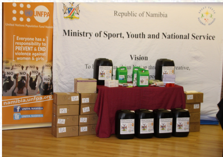
Some of the donated PPEs by UNFPA

On 17 September 2020, the United Nations Population Fund (UNFPA) donated Personal Protective Equipment (PPE's) to the MSYNS, to ensure readiness at all its training Centres. The ministerial training and multipurpose youth resource centres, had to be closed, due to COVID – 19, and the resulting emergency proclamation by His Excellency, the President.