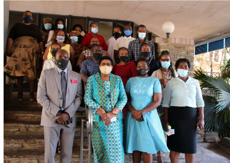
Directorate of Youth Development staff members