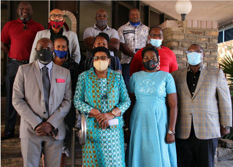
Directorate of Sport Development staff members